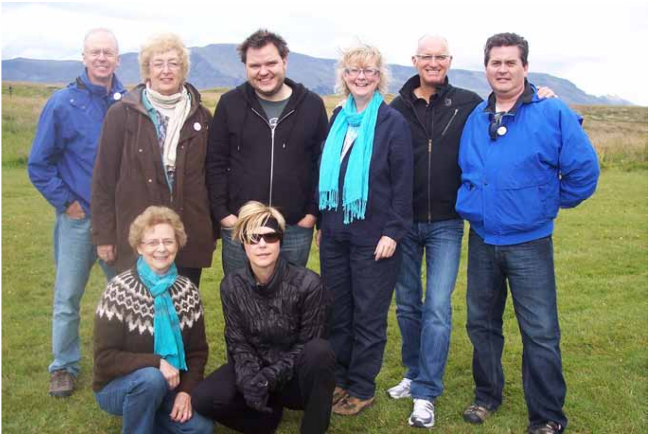
List of participants in the photo: