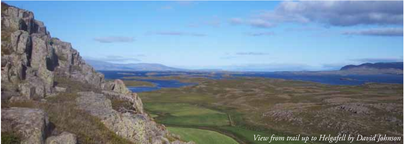
View from trail up to Helgafell